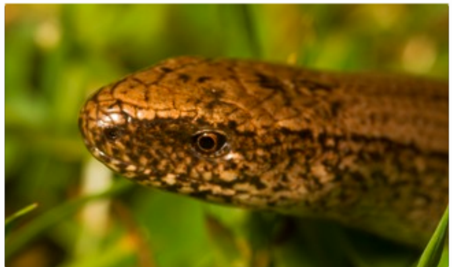
Slow Worm (Lacerta Vivipara)

Out for a stroll on a nice warm day we found our first Slow Worm for some years. So, how do you find a Slow Worm? The easiest way is to look around the periphery of 'undisturbed' fields and keep a special look out for discarded materials such as pieces of tin, cardboard even carpet or such. Slow worms like to bask in the heat to 'charge' themselves up, like all reptiles from the warmth of the sun and by hiding under thin materials such as corrugated iron they can do this in safety. Of course be sure to leave everything as you found it.