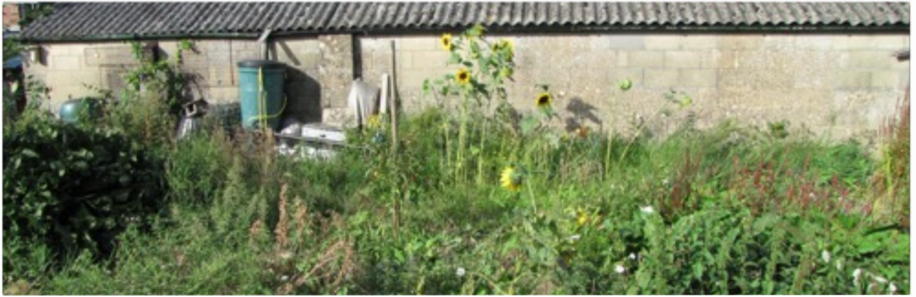
A few pictures of the MCFG wildlife garden as of the 4th of September 2011